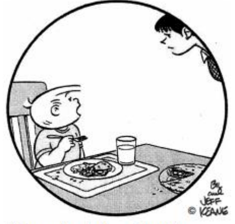
"If an apple a day keeps the doctor away, how many days do I get for an apple pie?"

from JoyfulNoiseletter.com Reprinted with permission