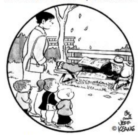
"But if he doesn't have a home, how can his children come for a visit?"

from JoyfulNoiseletter.com