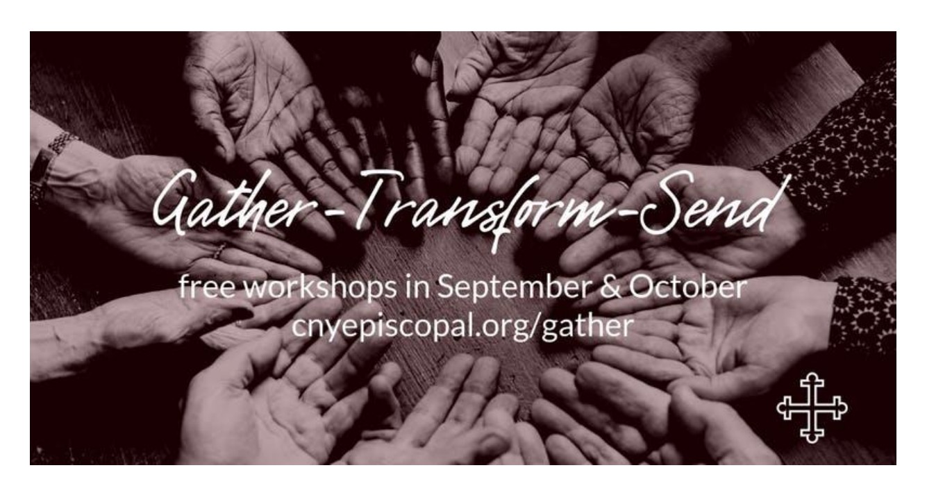
What is a congregation for?

These meetings will have their location announced in church as locations were not available at time of going to press for Crossways . If you are planning to attend, please phone Arlene Foley at 797-2111 or Eileen Patch at 754-2372 to aid in planning the group's reservation. Meetings are usually the third Wednesday of the month.