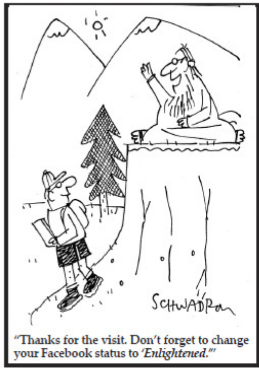
from JoyfulNoiseletter.com Reprinted with permission