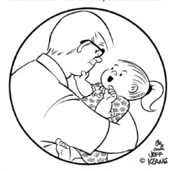
"You're better than just a father. You're a DADDY!" from JoyfulNoiseletter.com